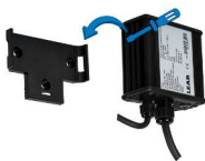
Fig. 3: Mounting the TS battery charger

To mount the battery charger, proceed as follows: