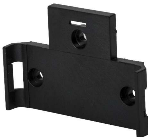
Fig. 2: Installation Clip TS Battery Charger